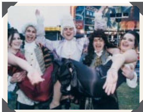
Right: Party time... Grand Ball, July 1993 and celebrating the new University at the Putteridge Bury Garden Party.

in many walks of life and Luton's record of graduate employment is second to none.