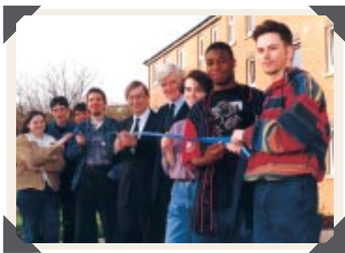
Left: November 26, 1993 – inauguration ceremony for the new University of Luton.

proud record in establishing centres of excellence, such as the new Centre for Competitiveness based at Putteridge Bury.