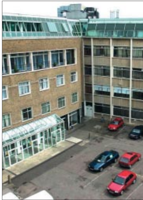
The Park Square site as it is now (right) and (below) how the new Plaza could look.