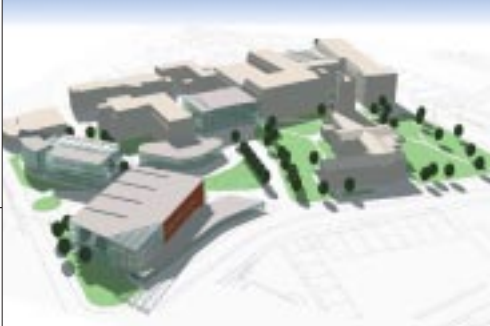
Right: Computer-aided design images prepared by consultant architects Scott Brownrigg & Turner. Below: The site of the new developments.

► MAKE A DONATION YOU can join forces with the University of Luton to build an even better future for students by: ■ Contributing to the future development plans. ■ Sponsoring a student. ■ Sponsoring an event. ■ Supporting the University's general development fund. Please check out our web site for more information, or send your cheque to: Development Office, External Affairs, University of Luton, Park Square, Luton LU1 3JU. We will, of course, keep you up-to-date by letting you know exactly how your contribution has helped. And, don't forget, if you are a UK tax-payer, your contribution could qualify under the 'Gift Aid' scheme. This means that the University can reclaim tax on your gift from the Inland Revenue.